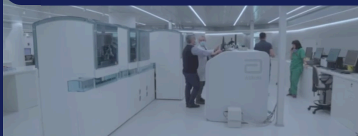
Clinical Centers of Excellence